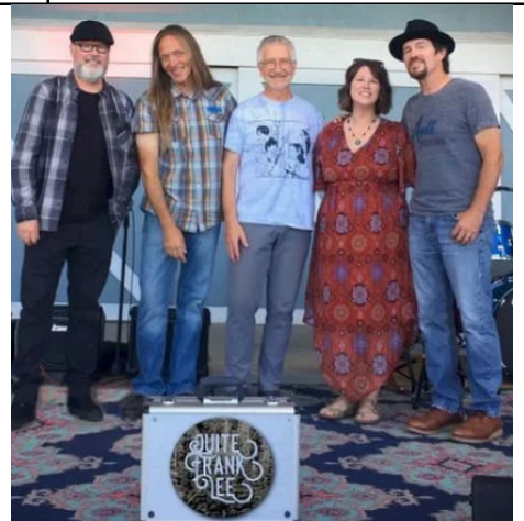
Quite Frank Lee

Enjoy live music with fellow Dunelanders on a beautiful summer evening in Three Oaks, Michigan on Saturday, July 25! Relax under the big oak trees at Dewey Cannon Park to hear Quite Frank Lee perform in the gazebo. Bring your picnic, beverages, and lawn chairs. Check out the complete schedule at the Harbor Arts website: Music in the Park — Harbor Arts