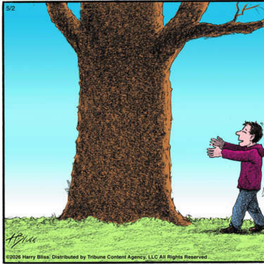
"Comin' in ..."

As always, dress for the weather and bring your own hydration. This time of year, ticks are still active and mosquitos are possible, so be prepared. There is one portable toilet at the parking lot.