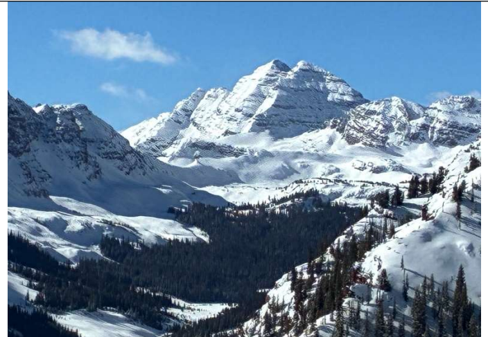
The Maroon Bells on a bluebird day!