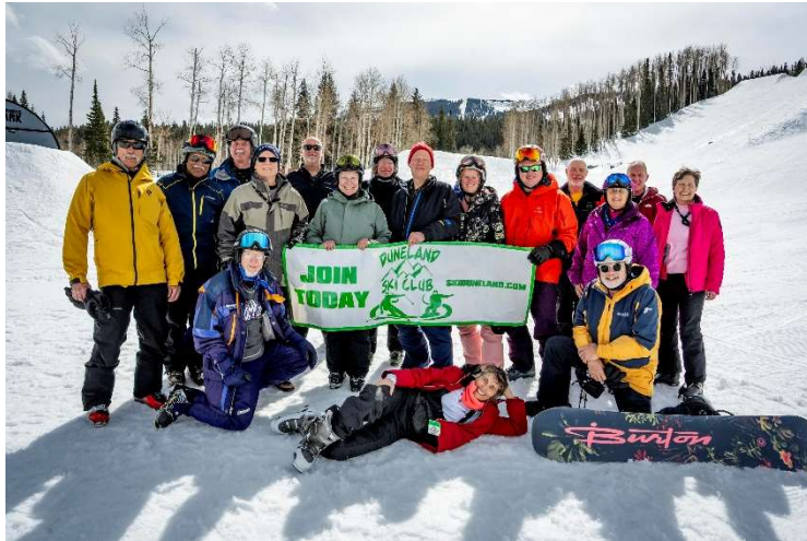
Duneland at Aspen/Snowmass! See more photos on the DSC Home Page Slide Show and Page 2 .