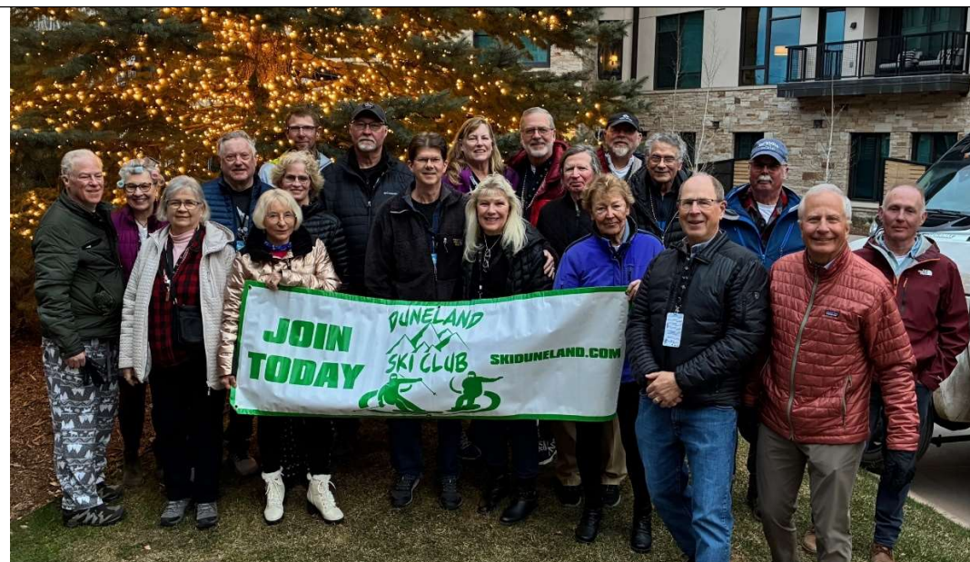
Chicago Week 2026 was capped off with a banquet, awards, and music.