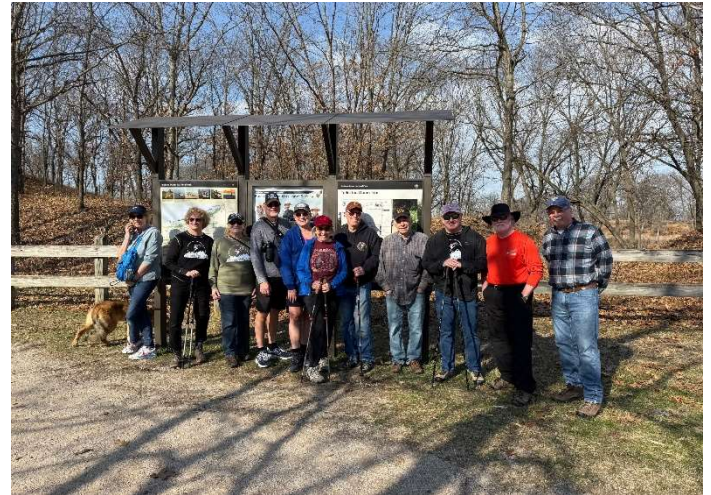
Twelve DSC members – and Luna - enjoyed the Tolleston Dunes hike. More hikes coming as Spring brings out the wildflowers! See Page 4 .