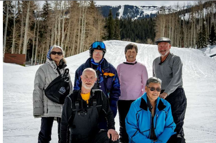
Dunelanders and friends at Snowmass